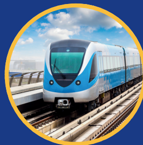
Metro Rail Project