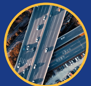
Six Lane Expressways