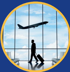
International Cargo Airport