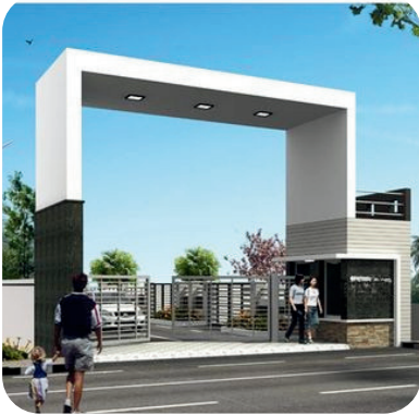
ATTRACTIVE ENTRANCE GATE