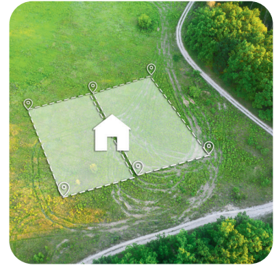
INDIVIDUAL PLOT MARKING