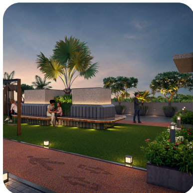
DEDICATED COMMON PLOT