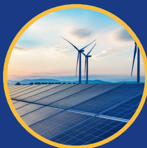
Wind & Solar Energy Plants